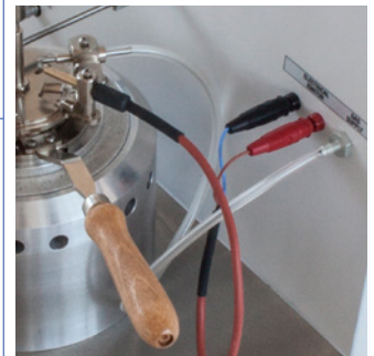
Gas with flame exposure device.